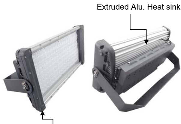
Pressure Die-cast Alu. Cover holding extruded Alu. Heat sink